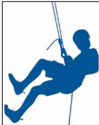
Item No. 101-007