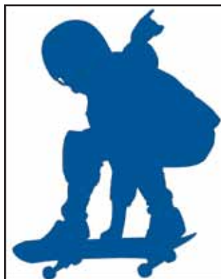
Item No. 101-009