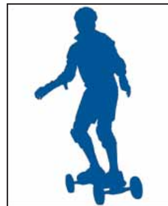
Item No. 101-010