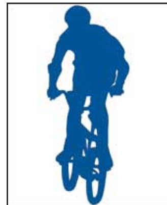
Item No. 101-008